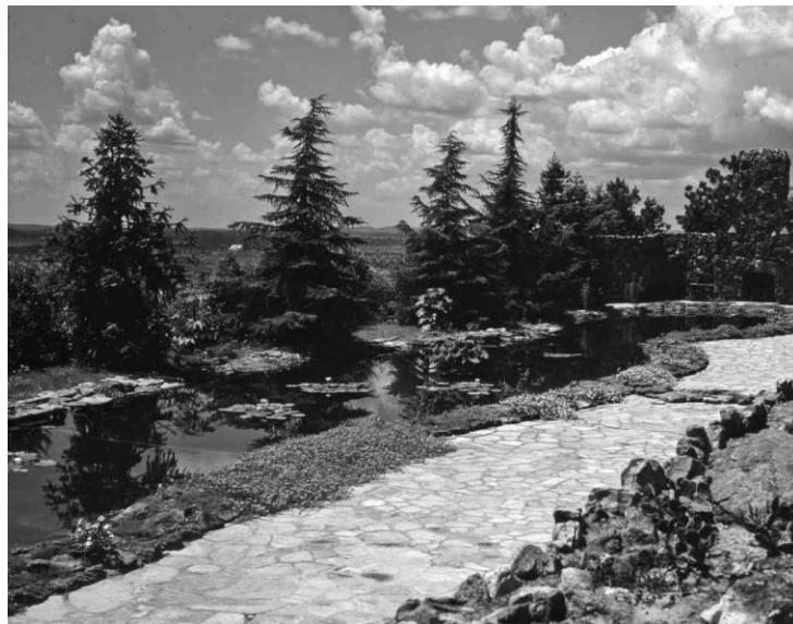
Crystal Hill Garden